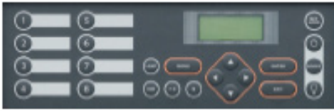
INTUITIVE KEYBOARD LAYOUT