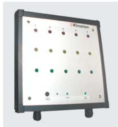
STA 5 Status Panel

projector: START / STOP dowsers: OPEN / CLOSE projection format: NS / WS / CS house light: ON / PRESET / OFF stage light: ON / OFF curtain: OPEN / CLOSE sound format: MONO / DOLBY A / DOLBY SR / DOLBY SRD external sound source: NONSYNC 1 / NONSYNC 2 / MUTE